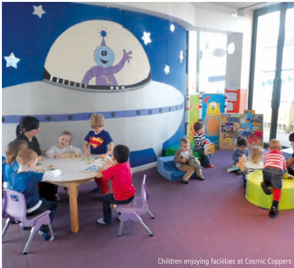
Children enjoying facilities at Cosmic Coppers