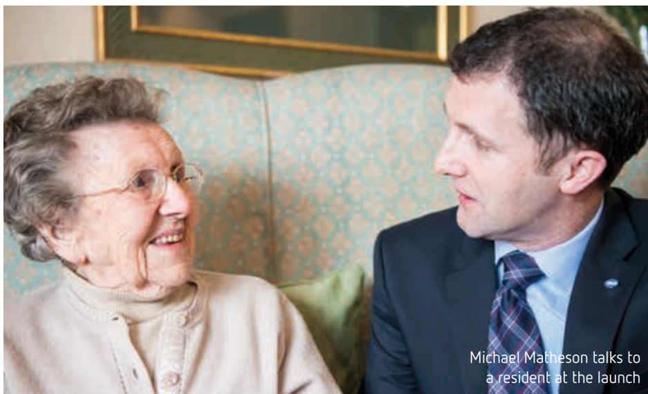
Michael Matheson talks to a resident at the launch