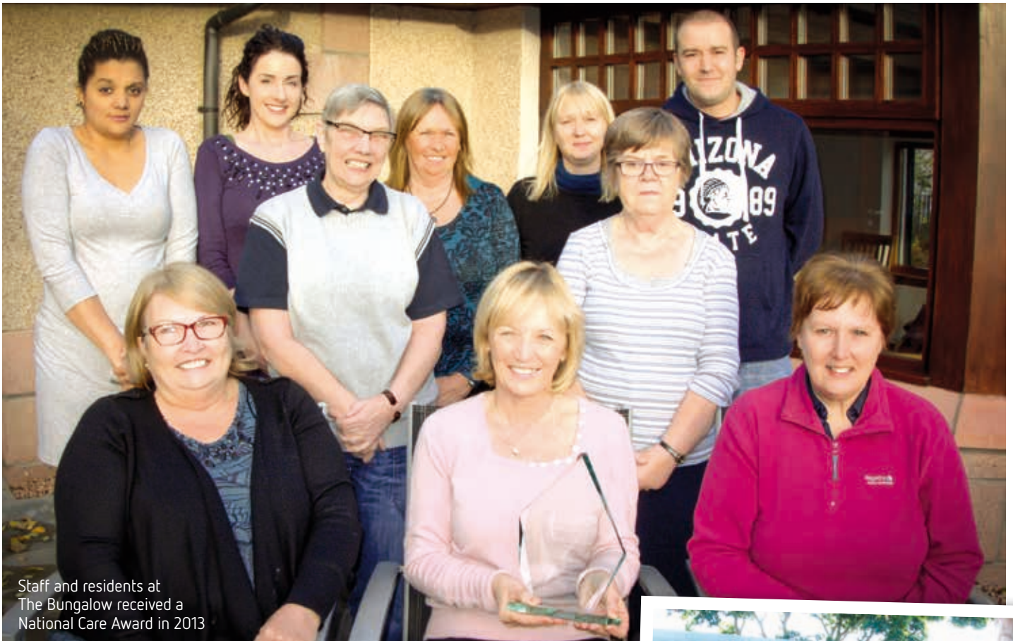
Staff and residents at The Bungalow received a National Care Award in 2013