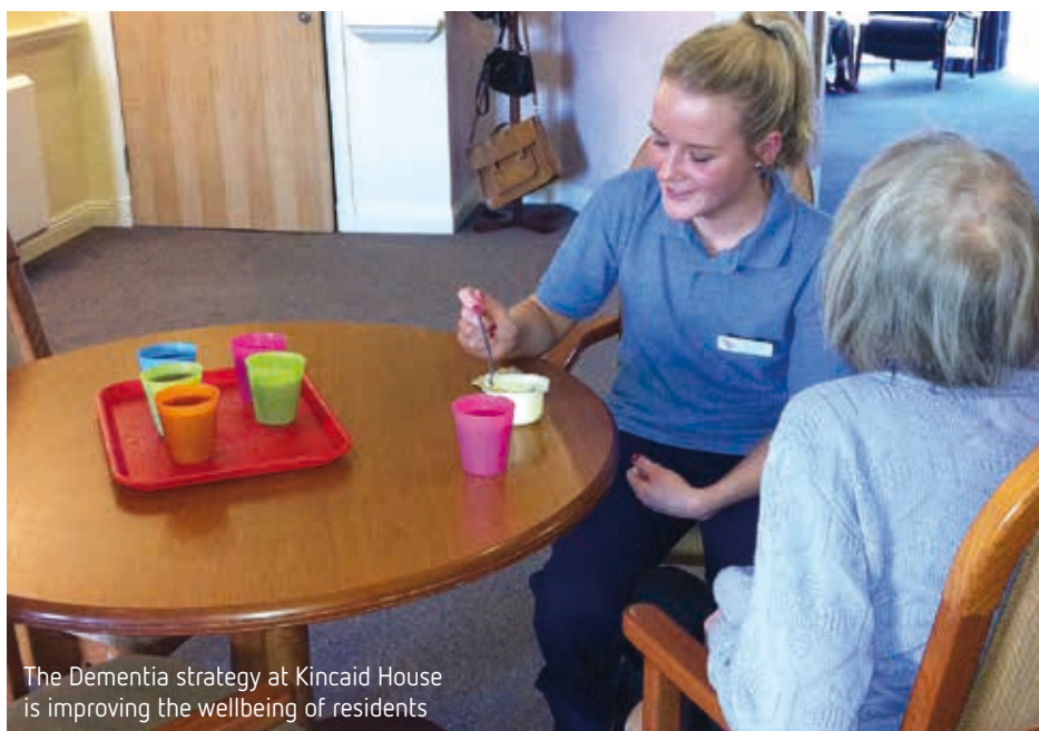
The Dementia strategy at Kincaid House is improving the wellbeing of residents

Snack boxes have been introduced for residents who don't wish to sit down for regular meals, helping those with low BMIs to either maintain or increase their weight. Similarly, highly coloured trays and cups of fluid have been placed around the home, encouraging residents to drink more. The results